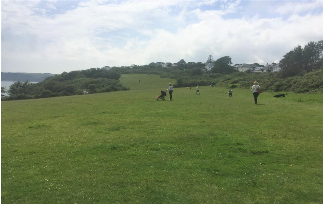
Figure 6 The western field on the southern edge of Sea Road

Area or “fields” are closely connected to local residents as they lie on the southern edge of Sea Road with its approx. 200 households.