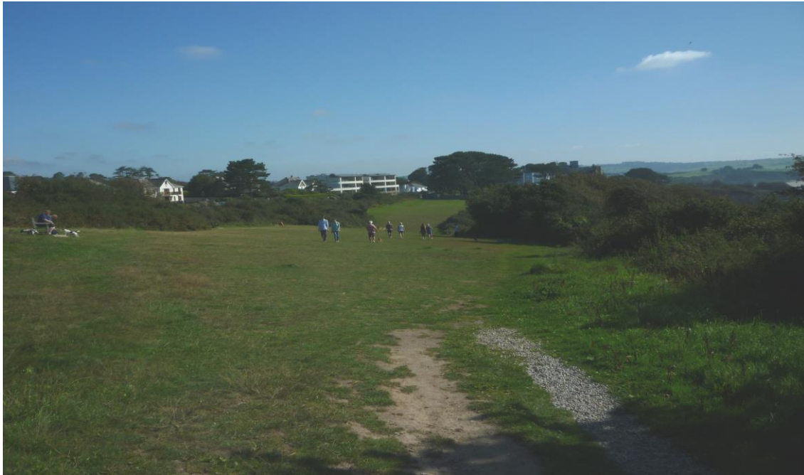
Figure 3 The western field looking east, with Sea Road to the left.

2.4 There are five benches with extensive views of St Austell Bay and its two Areas of Natural Beauty (AONBs) to the Gribben and Black Head. It is easily accessible via three gates adjacent to roadside parking and a privately owned car park (currently charges for this only apply during the summer holidays).