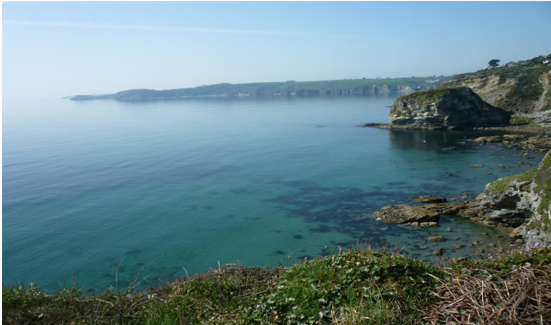
Figure 2 View of Black Head from eastern field

2.2 The site, on a clifftop overlooking St Austell Bay, gives users extensive views of the sea and the Bay's two headlands. It has three memorial benches which are popular resting places for walkers. A footpath between the cliff edge and the hotel grounds connects this area to the western field, which lies on the southern side of Sea Road.