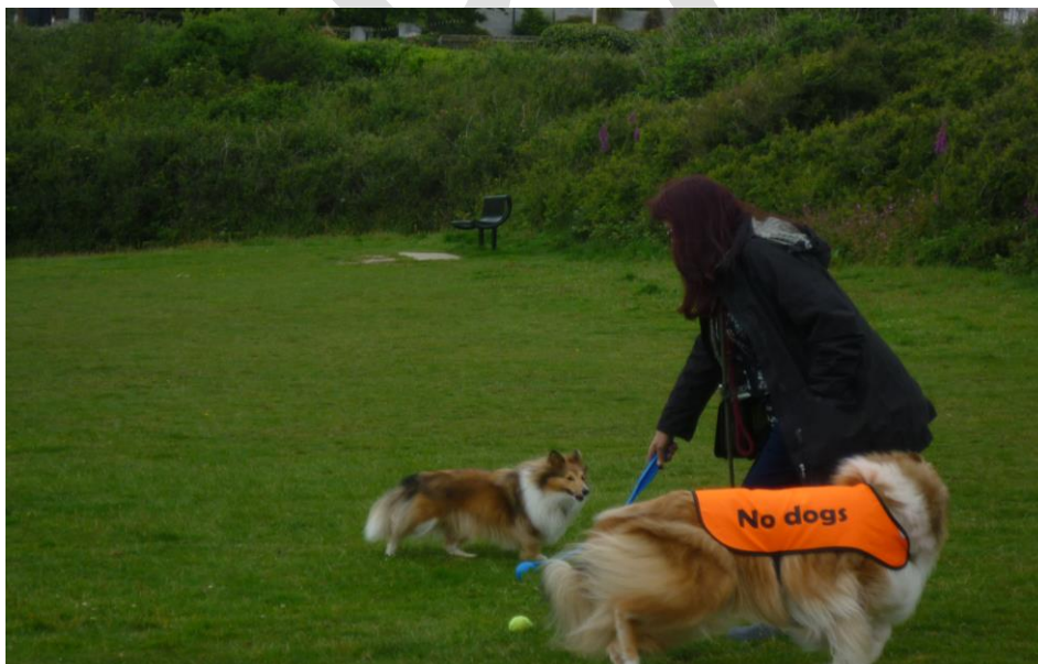
Figure 5 The fields are popular with dog owners

2.10 The Recreation Area and Coastal Path is well used by residents of Carlyon Bay, hotel guests and visitors but also by many from the wider St Austell area – as there are few open areas with sea views which are accessible by the general public. In particular dog owners who need an area to exercise their animals but who themselves cannot walk very far, find its easy accessibility essential. It is also an area where it's relatively safe to let dogs off the lead to get proper exercise.