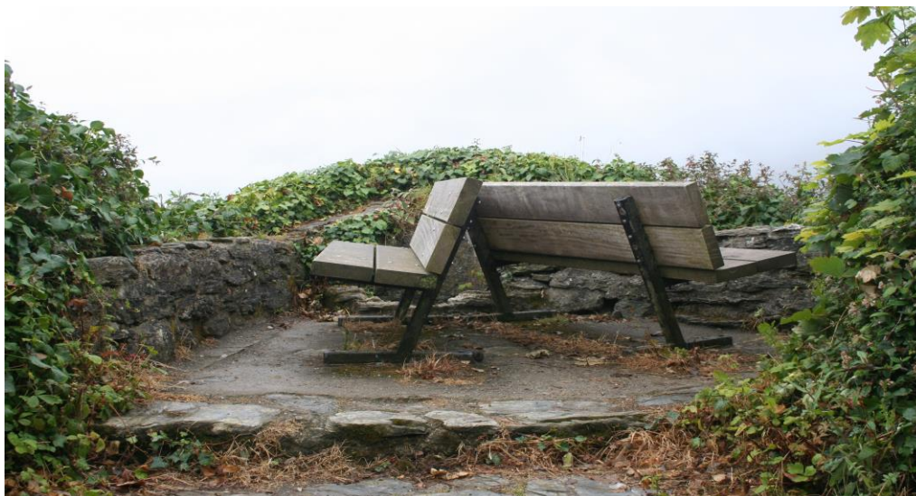
Figure 4 This former wartime structure was built on the remains of mine engine house

2.9 Just west of the Coastguard lookout is a circular concrete structure, formerly a WWII gun platform, which was built on the remains of an engine house of the 19C Appletree Mine. It is now furnished with two benches affording fine views of St Austell Bay and the World Heritage Site of Charlestown. (This structure has been included on the Parish List of Historic and Cultural Assets – Appendix 37)