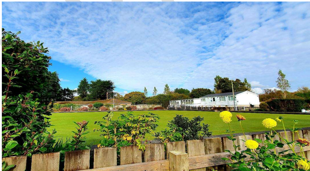
Figure 3 The bowling green is bordered by mature trees

1.3 The site is mainly a bowling green with an adjacent club house and space for car parking. It covers an area of some 1554 square metres or about 0.39 of an acre. Access is from Cypress Avenue.