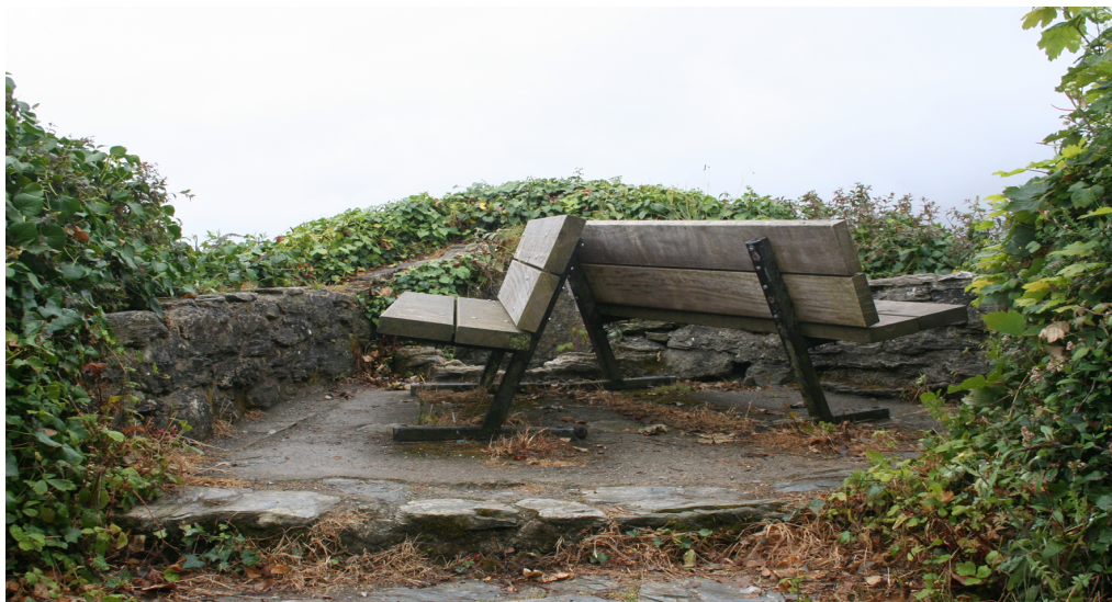
Figure 4 This former wartime structure was built on the remains of mine engine house

2.9 Just west of the Coastguard lookout is a circular concrete structure, formerly a WWII gun platform, which was built on the remains of an engine house of the 19C Appletree Mine. It is now furnished with two benches affording fine views of St Austell Bay and the World Heritage Site of Charlestown. (This structure has been included on the Parish List of Historic and Cultural Assets – Appendix 37)