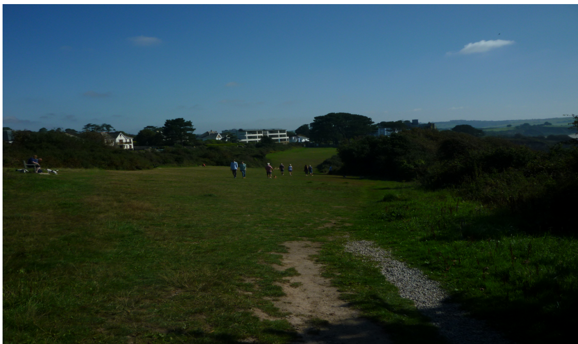
Figure 3 The western field looking east, with Sea Road to the left.

2.4 There are five benches with extensive views of St Austell Bay and its two Areas of Natural Beauty (AONBs) to the Gribben and Black Head. It is easily accessible via three gates adjacent to roadside parking and a privately owned car park (currently charges for this only apply during the summer holidays).