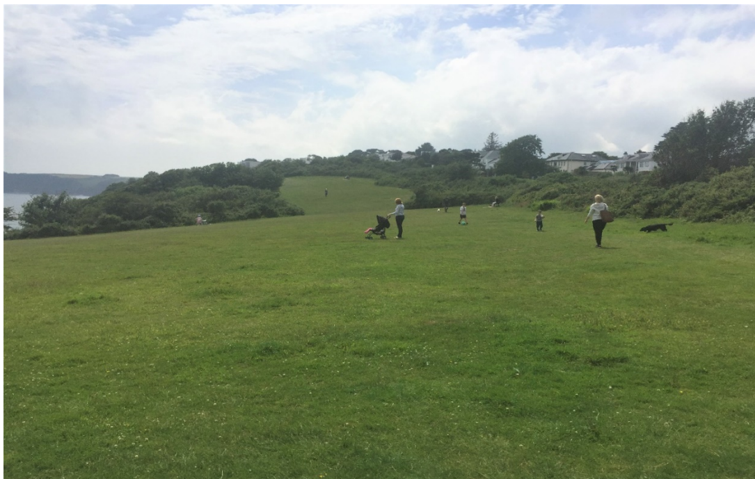
Figure 6 The western field on the southern edge of Sea Road

Area or “fields” are closely connected to local residents as they lie on the southern edge of Sea Road with its approx. 200 households.