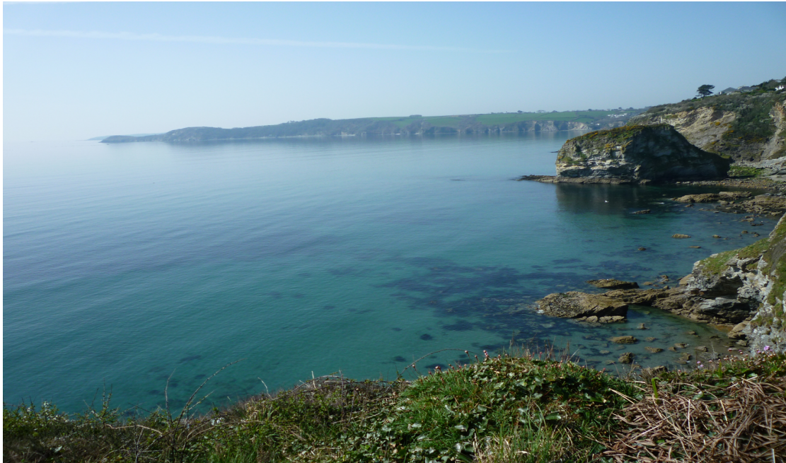
Figure 2 View of Black Head from eastern field

2.2 The site, on a clifftop overlooking St Austell Bay, gives users extensive views of the sea and the Bay's two headlands. It has three memorial benches which are popular resting places for walkers. A footpath between the cliff edge and the hotel grounds connects this area to the western field, which lies on the southern side of Sea Road.