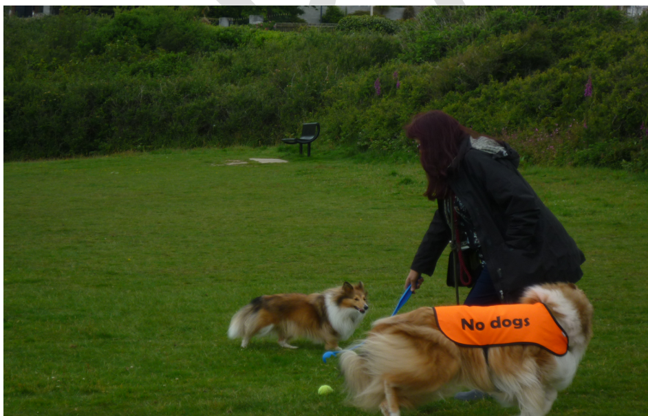
Figure 5 The fields are popular with dog owners

2.10 The Recreation Area and Coastal Path is well used by residents of Carlyon Bay, hotel guests and visitors but also by many from the wider St Austell area – as there are few open areas with sea views which are accessible by the general public. In particular dog owners who need an area to exercise their animals but who themselves cannot walk very far, find its easy accessibility essential. It is also an area where it's relatively safe to let dogs off the lead to get proper exercise.