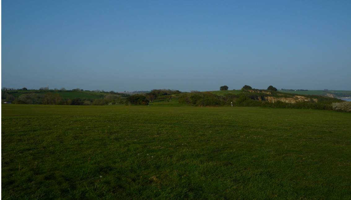
Figure 3 Views from the coastal path as it runs along the southern boundary of the Golf Course

2.1 Its significance is in its beauty, its recreational value, and the tranquillity it provides for local people and visitors. In a survey of local residents carried out for the Neighbourhood Development Plan, 99% of those who responded agreed or strongly agreed that the Parish's open spaces and coastal views were important aspects of the area.