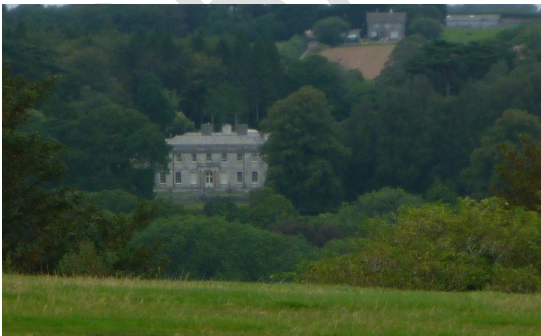
Figure 5 The Tregrehan estate, seen from the Golf Course.

2.5 Also visible from the path is the Tregrehan House and estate in the neighbouring Parish of St Blaise. This is of particular local significance because it was the home of the Carlyon family who once owned the land on which the Carlyon ward stands. Their descendants live there to this day. The land, including the Carlyon Bay beaches, was sold off in the early part of the 20 th century. This view from the coastal path affords an important visual link with the history of this part of the Parish.