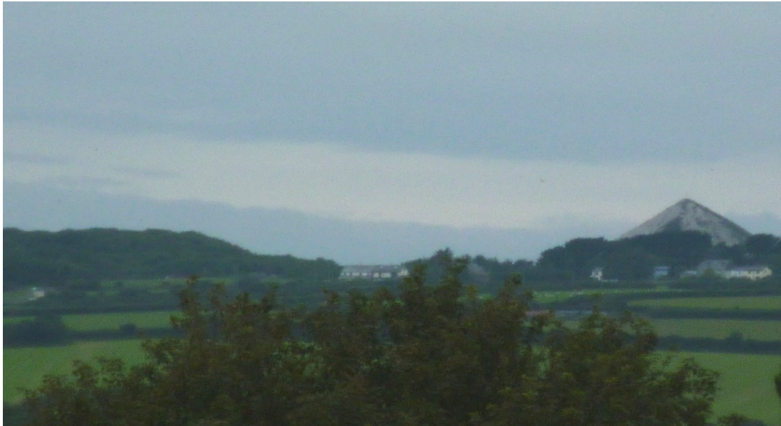
Figure 4 The Sky Tip or White Pyramid seen from the Golf Course

2.4 Beyond that, to the north, are views of the hills and fields above St Austell and St Blazey which mark the important clay mining areas, symbolised by the Sky Tip on the horizon, a local landmark also known as the White Pyramid.