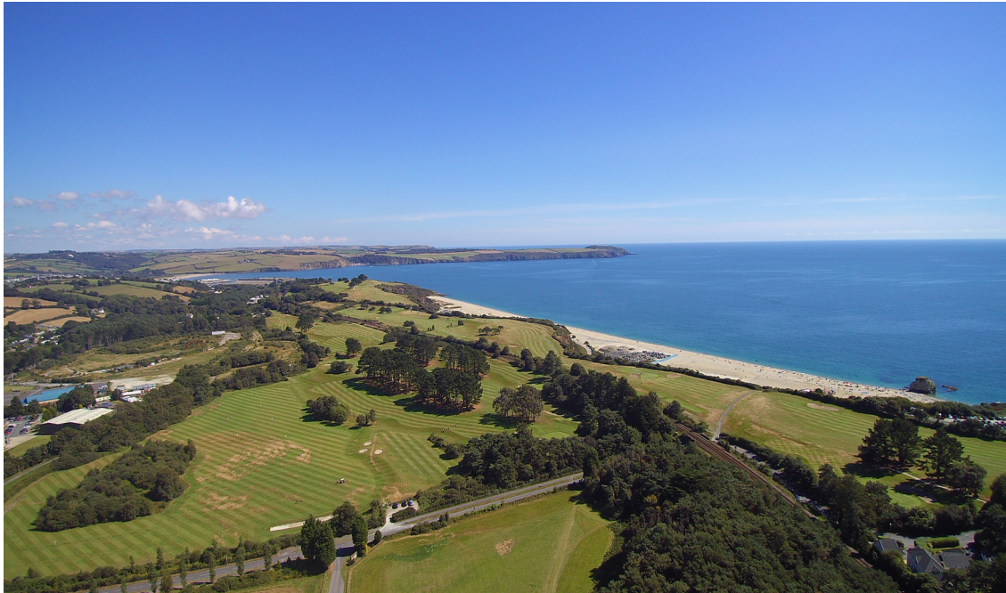
Figure 2 Aerial view of Carlyon Bay Golf Course

1.6 The open grassland of the course offers panoramic views of St Austell Bay on one side and the hills and fields above St Austell and St Blazey on the other. The southern or sea side of the area is bounded by hedge and scrub, occasionally reinforced by fencing. The SWCP enters the site from Beach Road on the western side and runs inside this hedge towards Par in the east. It is a beautiful clifftop walk, mostly flat or gently undulating, and is easy walking.