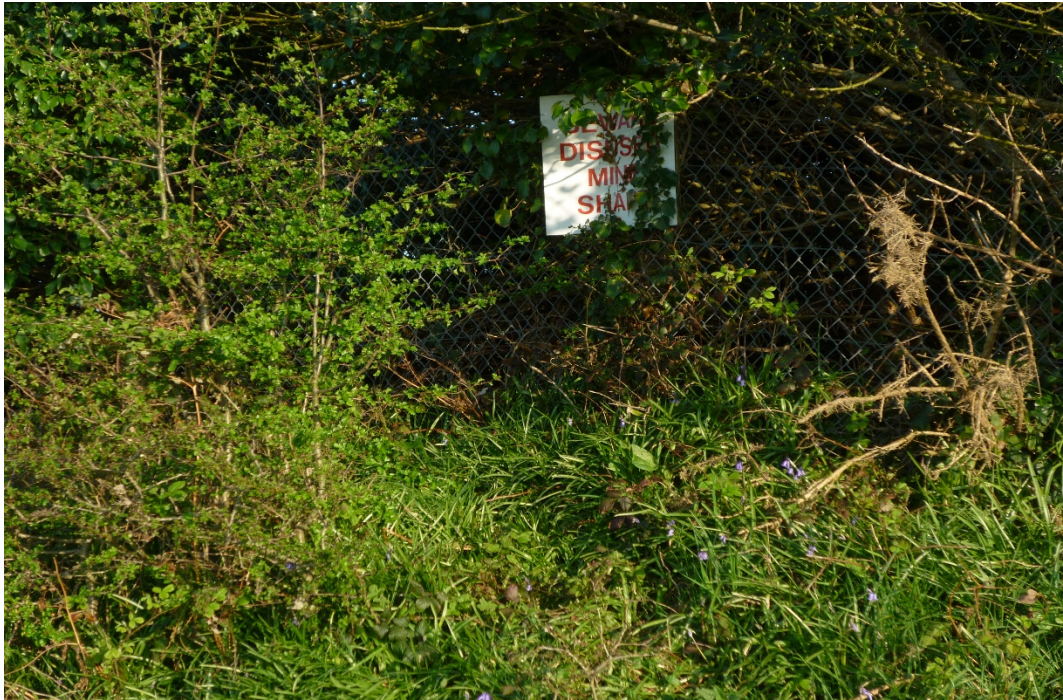
Figure 6 A number of disused mine shafts can be seen along the Golf Course

2.6 The land on which the Golf Course stands was once part of the numerous tin and copper mines which prospered around St Austell and St Blazey during the first half of the 19 th century. They were among the richest in Europe for a time before the price slump in the latter half of the century.