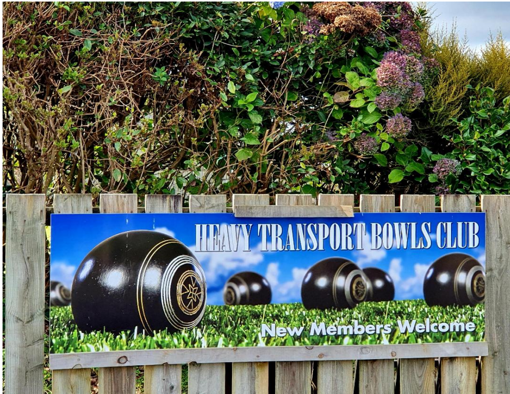
Figure 2 The entrance is off Cypress Avenue