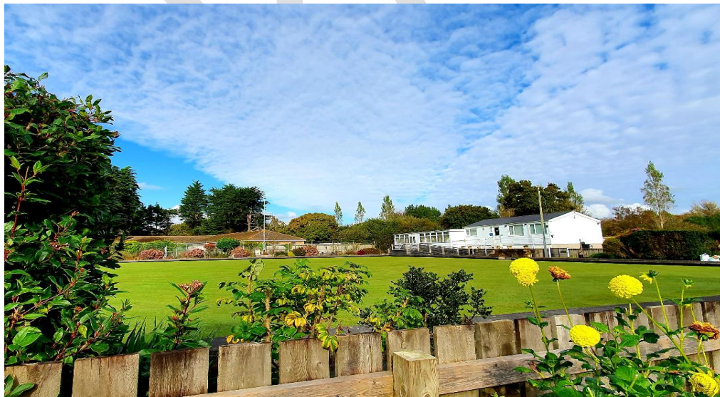
Figure 3 The bowling green is bordered by mature trees

1.3 The site is mainly a bowling green with an adjacent club house and space for car parking. It covers an area of some 1554 square metres or about 0.39 of an acre. Access is from Cypress Avenue.