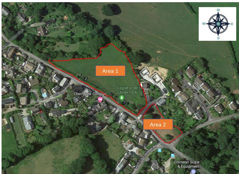
Figure 2 Satellite image showing the two areas of the Tregrehan Mills Recreation Ground

The ground is owned by Cornwall Council and maintained by subcontractors. It is located centrally to the village in the valley bottom, encompassing approximately 2.2 acres in total. It is formed by two areas separated by an access lane to four residential dwellings. The two areas are highlighted in the satellite image below: