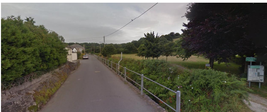
Figure 7 View of Area 1 looking along its south west border

To the south west, the 162-metre boundary is bordered by the Tregrehan stream with a small embankment of scattered scrub and some semi-mature trees (see image below).