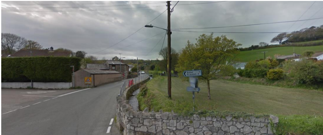
Figure 9 View of Area 2 looking along its southern border

As with Area 1, to the south west the area is bordered by the Tregrehan stream for approximately 60 metres, with a small embankment of scattered scrub (see image below).