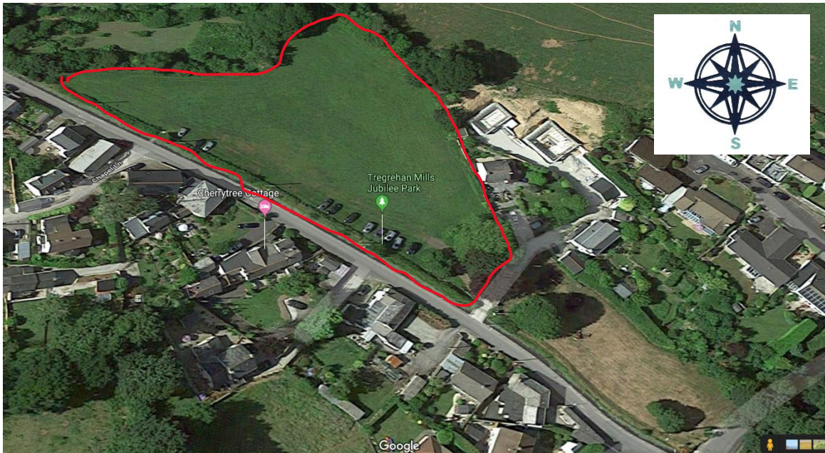
Figure 3 Satellite image showing Area 1 of the Tregrehan Mills Recreation Ground

Area 1 (Latitude 50.351122, Longitude -4.748754) forms the largest of the two areas, encompassing approximately 1.9 acres, and is classified solely as 'Parks and garden; Amenity green space; Civic Spaces'. It is predominantly improved grassland with some mature trees planted inside the borders.