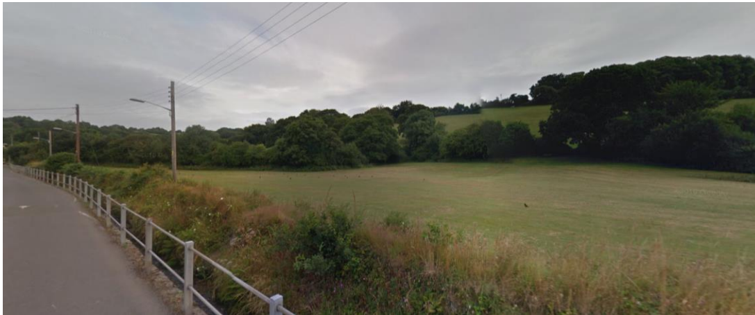
Figure 5 View Area 1 looking across to its north and north west borders

Area 1 is bordered to the north and north west by 92 metres of strong hedge boundaries and broad-leaved mature trees (see image below).