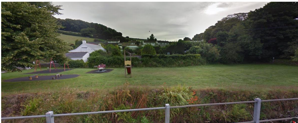
Figure 10 View of Area 2 looking across to its eastern border

The 60 metre north eastern border adjoins the garden of Mill Cottage and is a combination of scattered scrub on improved grassland with a drainage ditch (see image below).