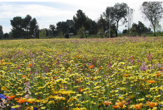
Wildflower planting underway