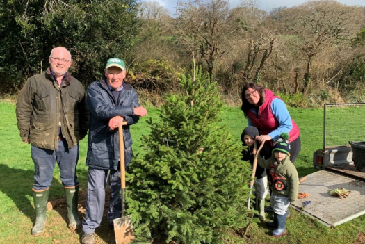
Living Christmas tree planted