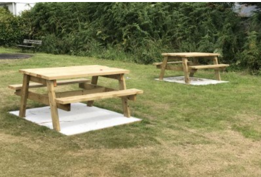
Picnic benches installed