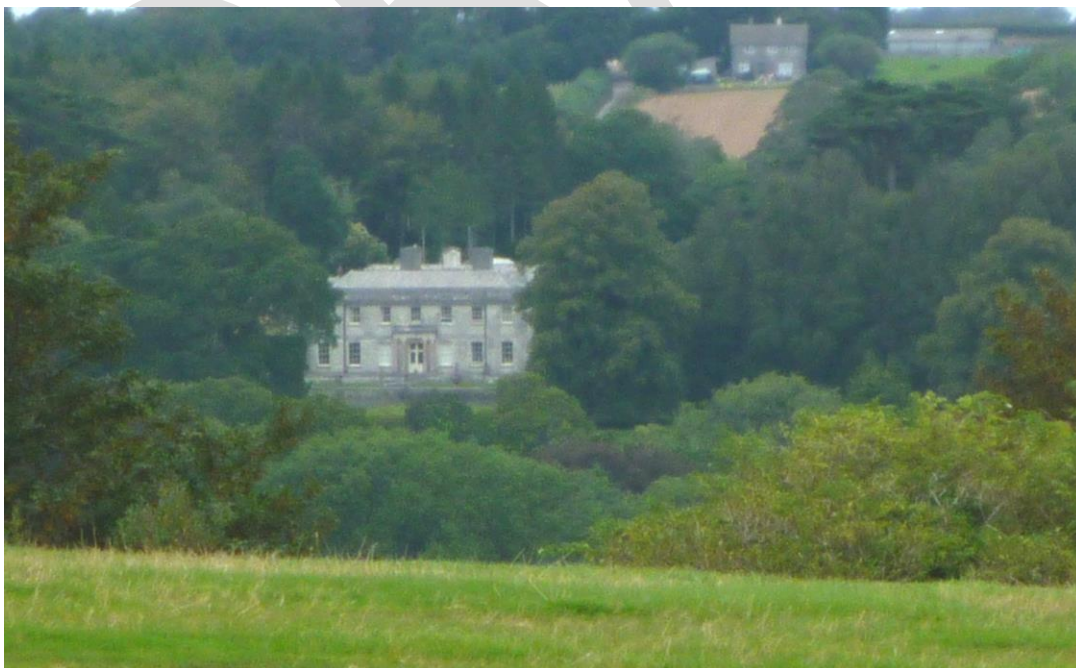
Figure 5 The Tregrehan estate, seen from the Golf Course.

2.5 Also visible from the path is the Tregrehan House and estate in the neighbouring Parish of St Blaise. This is of particular local significance because it was the home of the Carlyon family who once owned the land on which the Carlyon ward stands. Their descendants live there to this day. The land, including the Carlyon Bay beaches, was sold off in the early part of the 20 th century. This view from the coastal path affords an important visual link with the history of this part of the Parish.