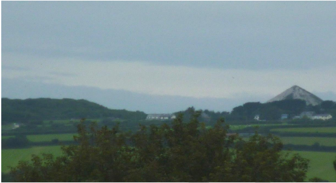
Figure 4 The Sky Tip or White Pyramid seen from the Golf Course

2.4 Beyond that, to the north, are views of the hills and fields above St Austell and St Blazey which mark the important clay mining areas, symbolised by the Sky Tip on the horizon, a local landmark also known as the White Pyramid.