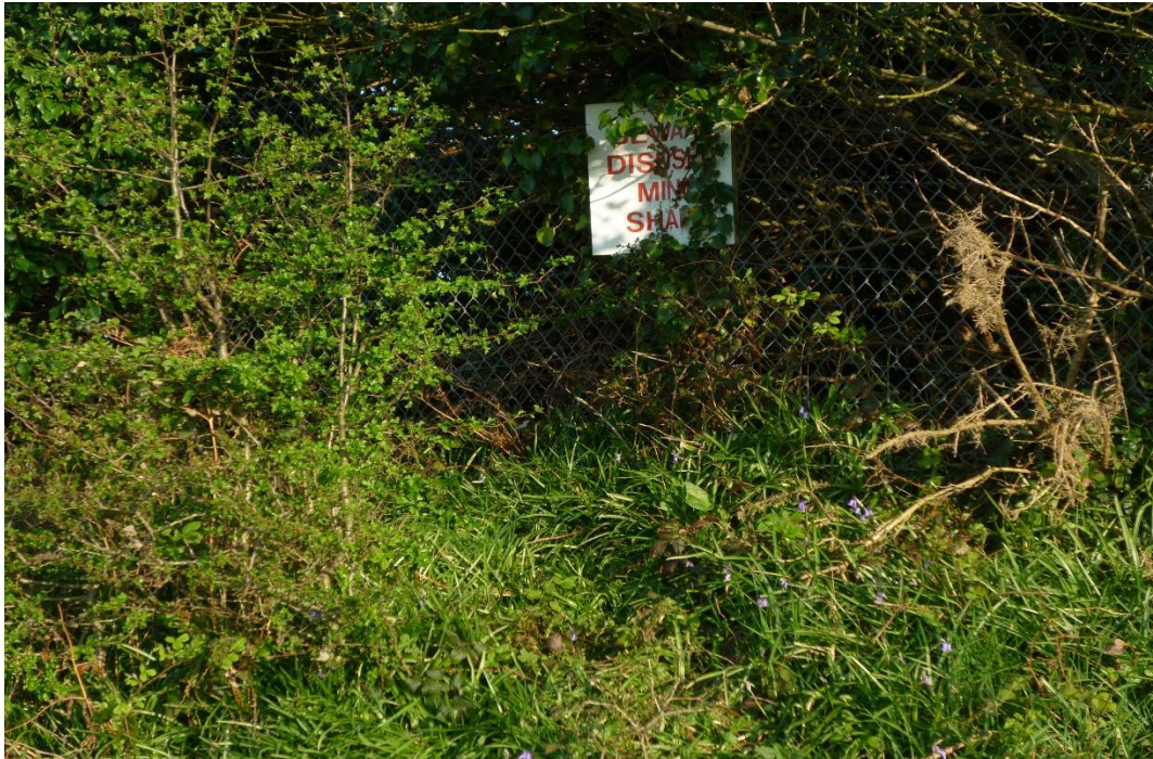
Figure 6 A number of disused mine shafts can be seen along the Golf Course

2.6 The land on which the Golf Course stands was once part of the numerous tin and copper mines which prospered around St Austell and St Blazey during the first half of the 19 th century. They were among the richest in Europe for a time before the price slump in the latter half of the century.