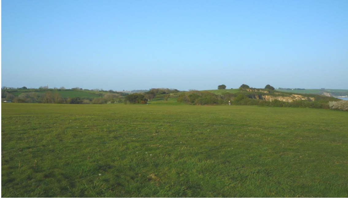
Figure 3 Views from the coastal path as it runs along the southern boundary of the Golf Course

2.1 Its significance is in its beauty, its recreational value, and the tranquillity it provides for local people and visitors. In a survey of local residents carried out for the Neighbourhood Development Plan, 99% of those who responded agreed or strongly agreed that the Parish's open spaces and coastal views were important aspects of the area.