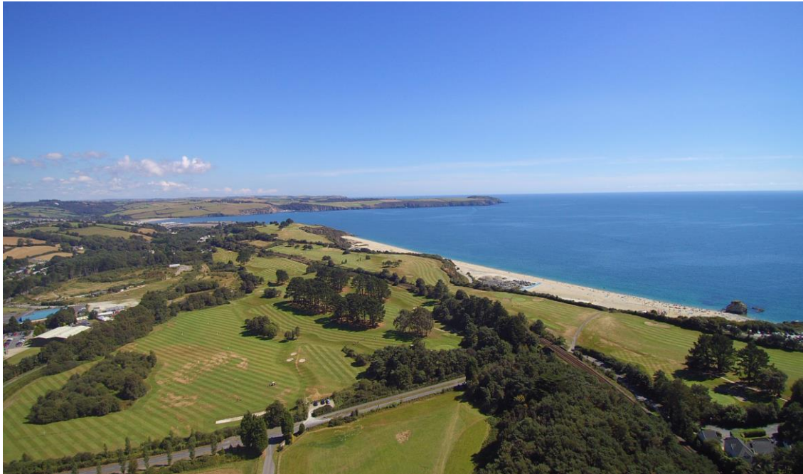
Figure 2 Aerial view of Carlyon Bay Golf Course

1.6 The open grassland of the course offers panoramic views of St Austell Bay on one side and the hills and fields above St Austell and St Blazey on the other. The southern or sea side of the area is bounded by hedge and scrub, occasionally reinforced by fencing. The SWCP enters the site from Beach Road on the western side and runs inside this hedge towards Par in the east. It is a beautiful clifftop walk, mostly flat or gently undulating, and is easy walking.