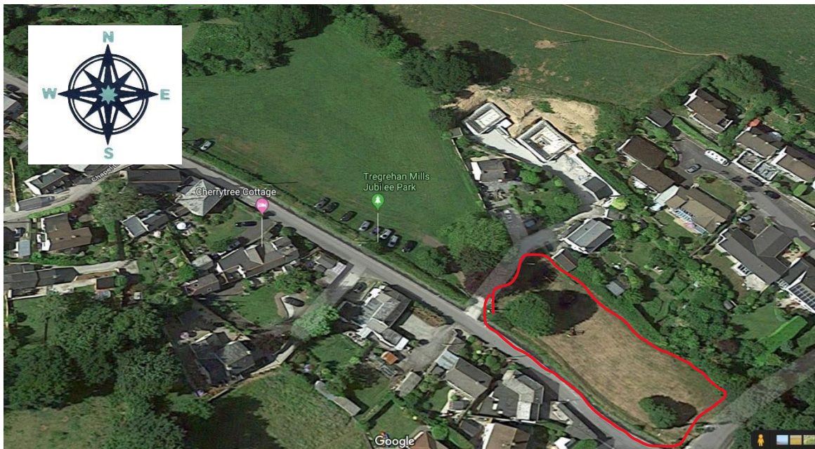
Figure 7: Satellite image showing Area 2 of the Tregrehan Mills Recreation Ground

3.2 The area is comprised of an equipped children's playground in its upper section, accounting for approximately 40% of the total area with improved grassland in the lower section accounting for approximately 60% of the total area.