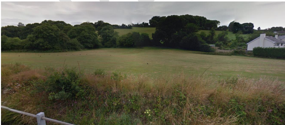
Figure 3: Panoramic view of Area 1 looking north from its southern border

2.2 The area has pedestrian access through a gate and over a small bridge in its south western corner and has further vehicular and pedestrian access through a field gate in its south east corner.