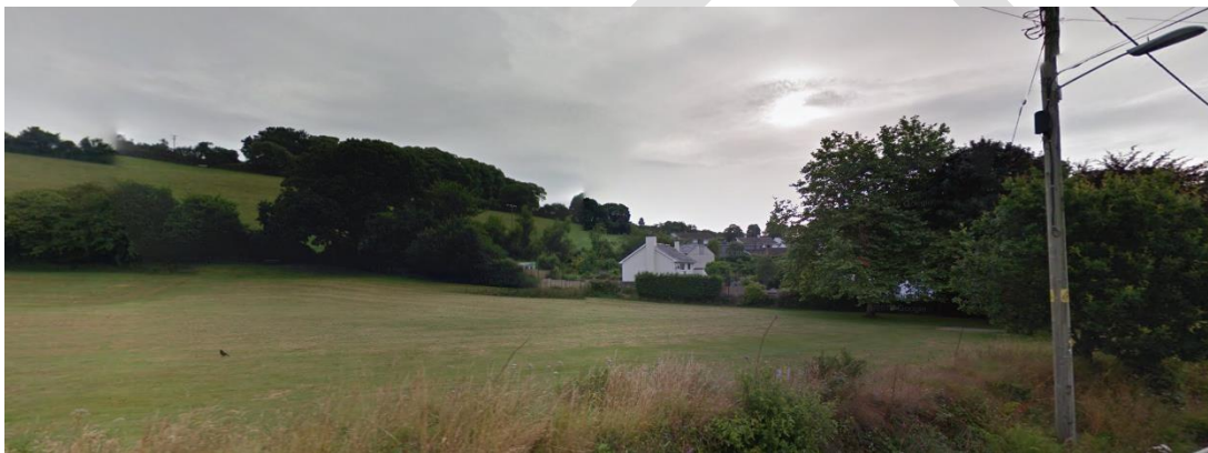
Figure 5: View of Area 1 looking across to its north east border

2.4 To the north east, the 65-metre boundary is bordered by wooden fencing and conifer hedges where the area adjoins two residential properties (see image below).