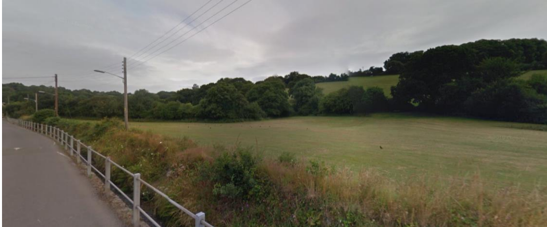
Figure 4: View Area 1 looking across to its north and north west borders

2.3 Area 1 is bordered to the north and north west by 92 metres of strong hedge boundaries and broad-leaved mature trees (see image below).