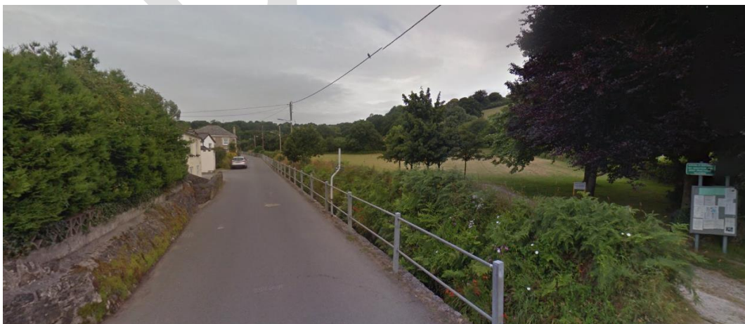
Figure 6: View of Area 1 looking across its south west border

2.5 To the south west, the 162-metre boundary is bordered by the Tregrehan stream with a small embankment of scattered scrub and some semi-mature trees (see image below).