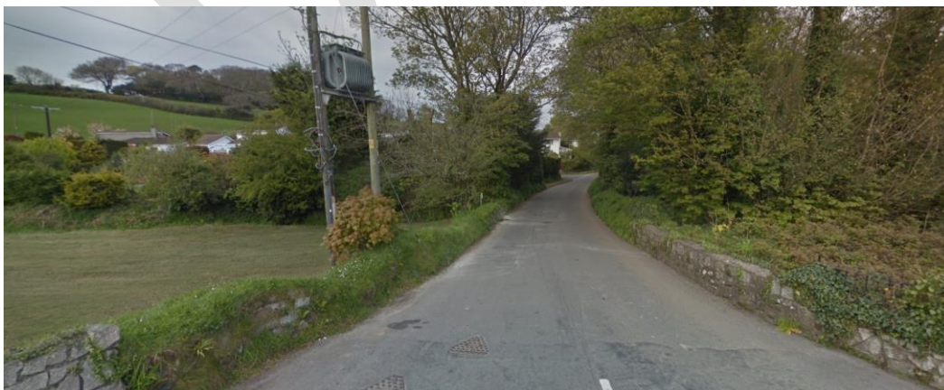
Figure 11: View of Area 2 looking at its south east border

3.6 To the south east, the 20-metre border adjoins the lane leading to Bodelva and is comprised of stone walling with scattered scrub (see image below).