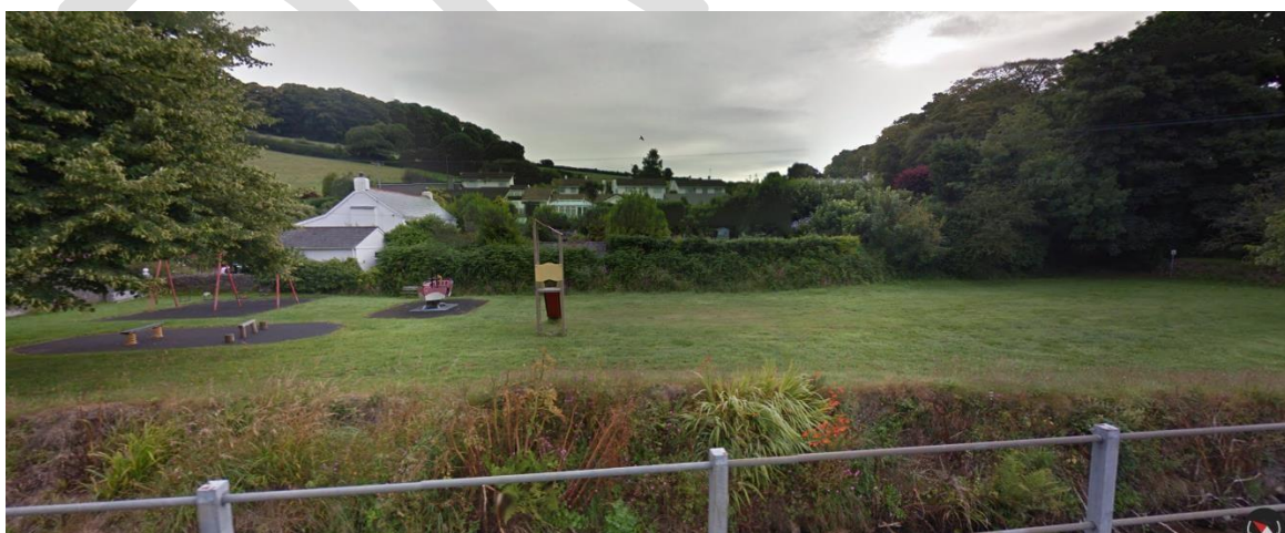
Figure 8: Panoramic view of Area 2 looking north east

3.3 The area has pedestrian access through a gate from the adjoining lane on its western corner and has further vehicular access through a field gate in its northern corner.